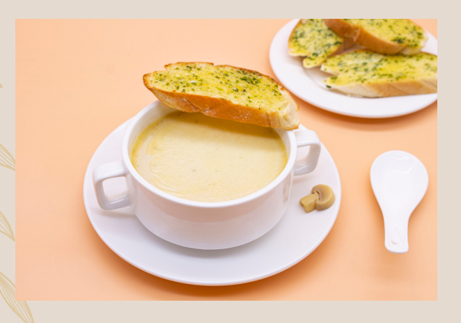
Homemade Mushroom Soup 18,000 MMK+ 自制蘑菇汤

Creamy mushroom soup served with garlic bread