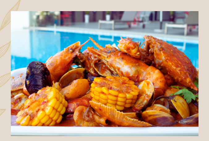
Thai Style Seafood Curry 泰式海鲜咖喱

Steamed pork belly served with sour mustard leaves