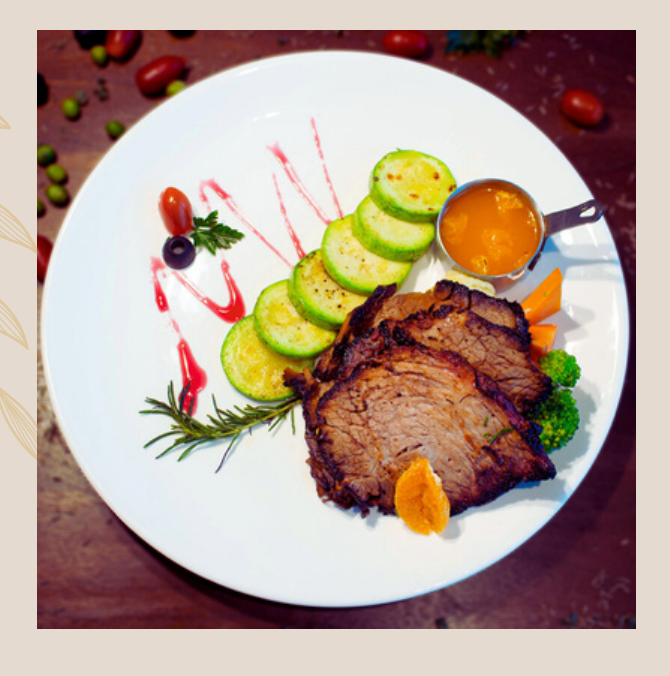
Grilled Corned Beef 烤咸牛肉