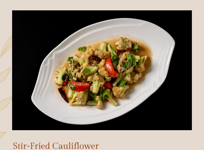
炒菜花 Stir-fried cauliflower with egg