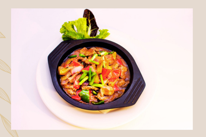
Chinese Beef Hot-Plate 中式铁板牛肉

Sauteed sliced beef with capsicum, chili and oyster sauce