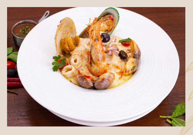
Cheesy Baked Rice (Seafood) Cheesy Baked Rice 芝士焗饭

奶油培恨息不利面 Spaghetti pasta with bacon and mushroom in cream sauce