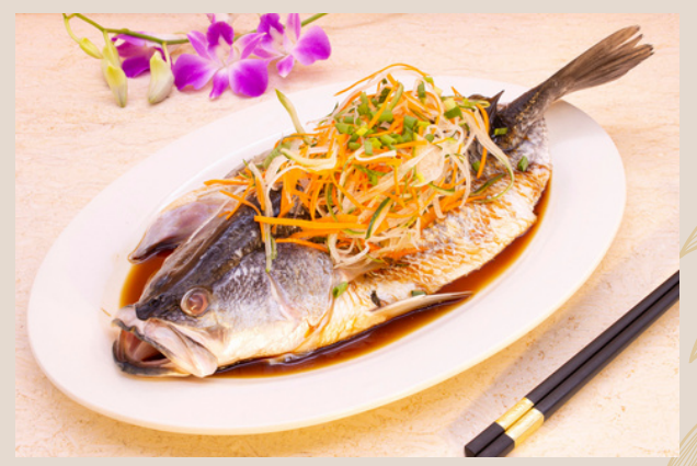
Hong Kong Style Steamed Fish 35,000 MMK+ 港式清蒸鱼

Sauteed sliced beef with capsicum, chili and oyster sauce