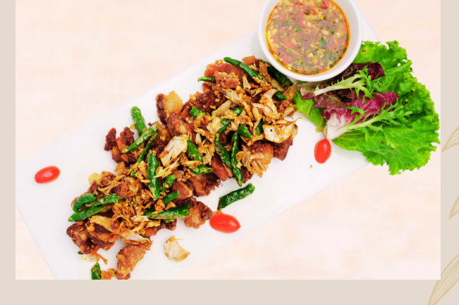
Three Layer Crispy Pork Belly 23,000 MMK+ 蒜香炸五花肉