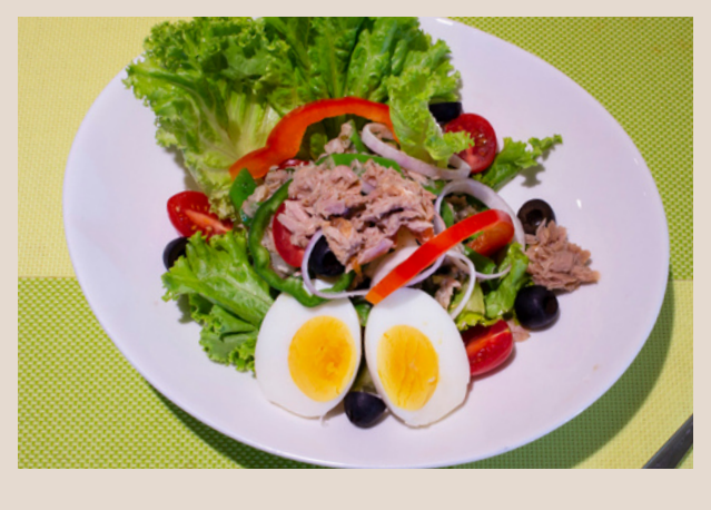
Nicoise Salad with Potato and Tuna 尼科西亚沙拉配土豆和金枪鱼 19,000 MMK+

Tossed Lettuces with caesar dressing and croutons, choice of chicken or bacon