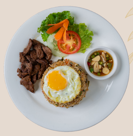
Pashu Fried Rice (Pork/ Beef/ Chicken) Pashu Seafood Fried Rice 15000/ 18,000 MMK+

Fried rice with kimchi, dashi powder, dried shrimps, fried egg and choice of pork, beef or chicken