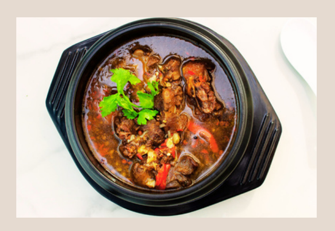
Oxtail Soup ( 牛尾汤 (小/大)