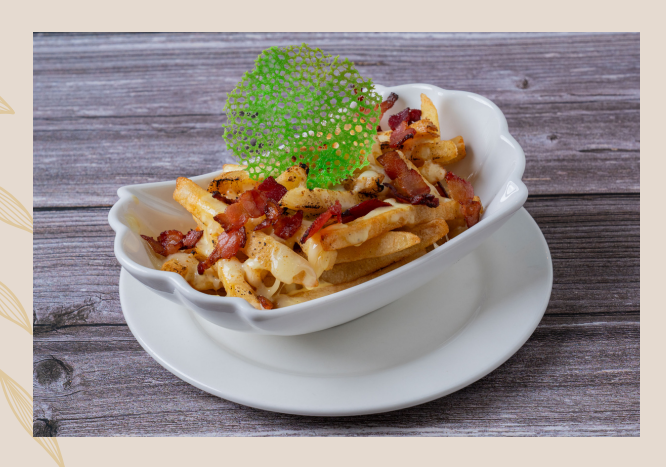
Fried Cheesy Potato with Bacon 芝士土豆配培根 33,000 MMK+

Potato fries topped with cheese and home made bacon