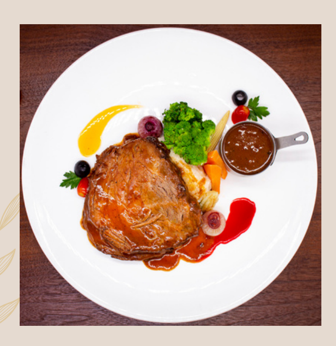
Homemade Roast Beef 自制烤牛排(蒸)

Grilled wagyu beef steak served on bed of mashed potatoes, accompanied with carrot, baby corn, cherry tomato and red wine sauce