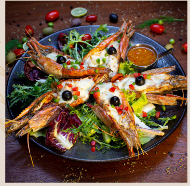
Baked Prawns 焗烤黄金虾

Oven-baked prawns with mozzarella cheese