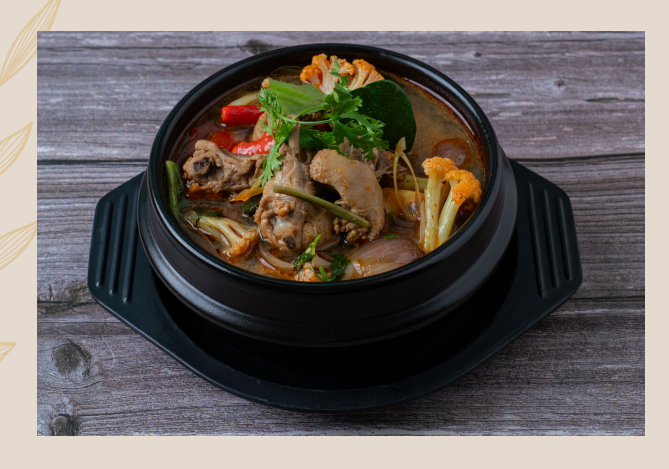
Chicken Tomyum Soup (Small/ Big) 泰式冬阳鸡肉汤 (小/大)

Hot & Sour soup with cat fish and bamboo shoot