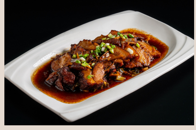
Steamed Pork Belly 梅菜扣肉