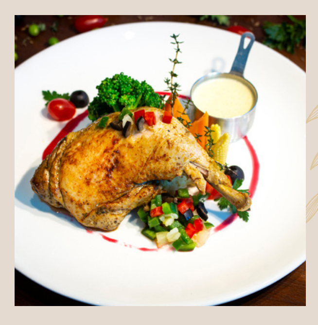
Mexican Style Grilled Chicken Leg 墨西哥风味烤鸡腿 25,000 MMK+

Served on mashed potatoes, accompanied with carrot, zucchini, broccoli and orange sauce