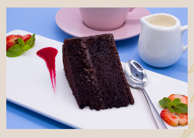
Chocolate Cake 巧克力蛋糕