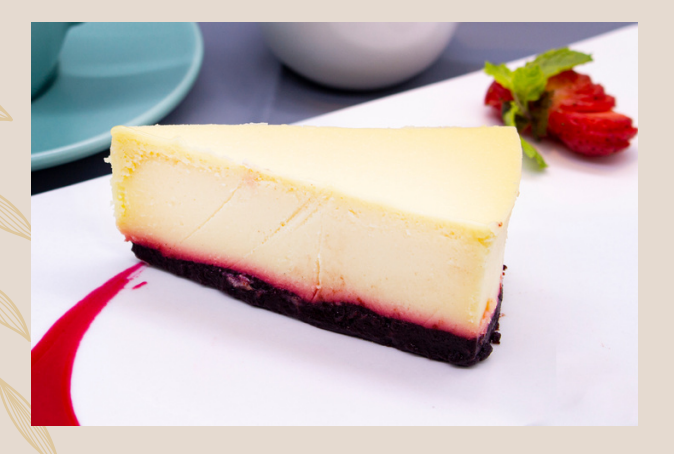
Yogurt Cheese Cake 酸奶芝士蛋糕