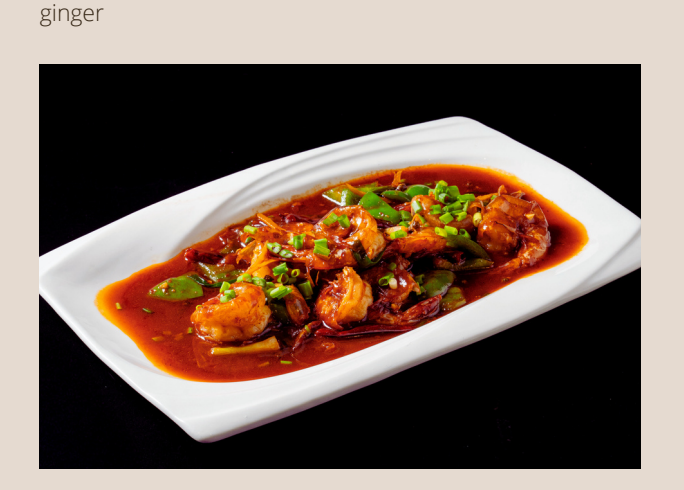
Szechaun Prawns 川味香辣虾

Stir-fried chicken and tofu in hot bean sauce