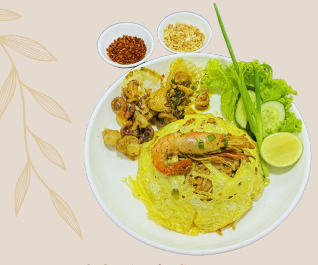
Pad Thai (Seafood) 泰式炒河粉 (海鲜)