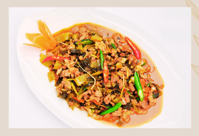
Pickled Mustard with Pork 腌菜炒肉(猪肉)

Wok-fried pork loin with pickled mustard