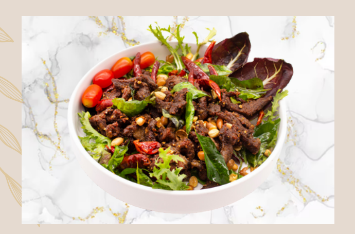
Sun Dried Beef 牛干巴