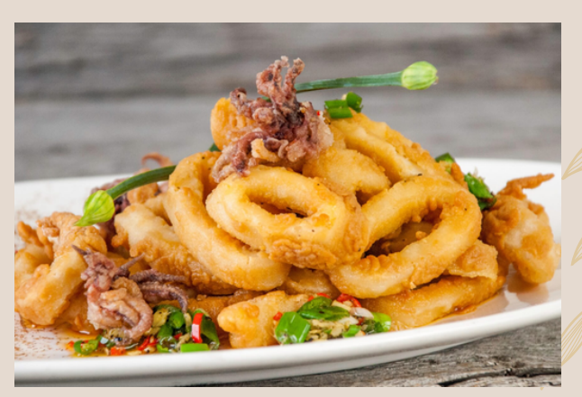
Fried Squid 蒜香鱿鱼

Deep fried beef with crushed pepper, corn, peanuts, ginger, chilli, garlic and curry leaves