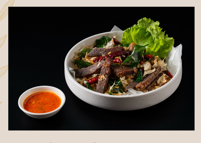
Deep Fried Corn Beef 香酥牛肉