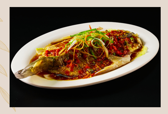
Steamed Seabass with Sour Chilli 酸辣清蒸鲈鱼 35,000 MMK+ Steamed seabass with light soy sauce, sour chili, garlic and