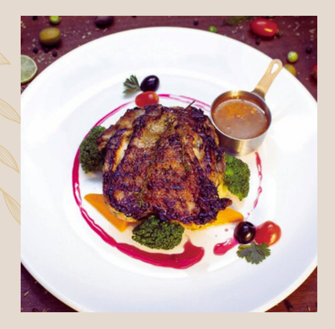
Grilled Beef Steak (Black Pepper/ Red Wine Sauce) 牛排(黑胡椒酱/红酒酱)

Served on mashed potatoes, accompanied with carrot, baby corn and choice of red wine sauce or pepper sauce