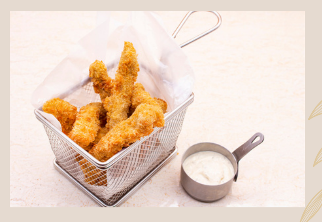
Fried Fish Finger 炸鱼柳条

Deep-fried potatoes served with ketchup and chili sauce