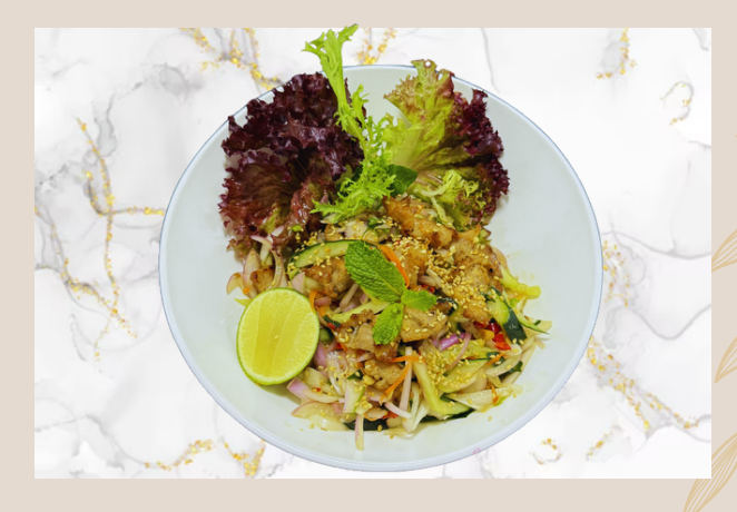
泰式凉拌猪颈肉 Grilled pork neck with cucumber, tomatoes, onion and lemon garlic chilli coriander sauce