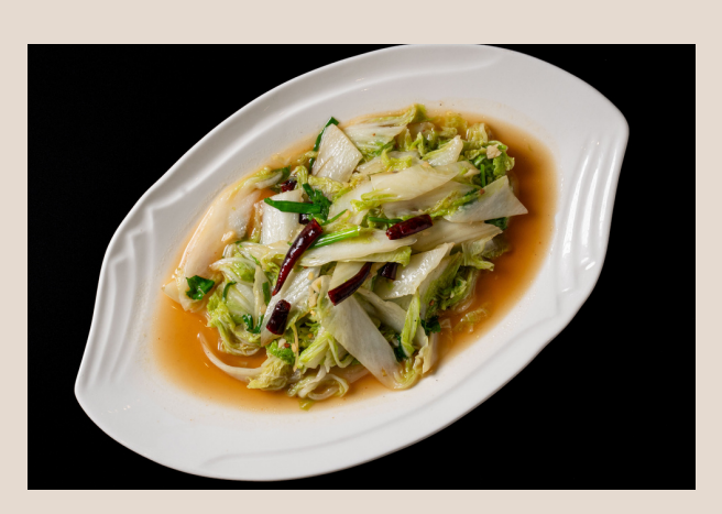
Stir-Fried Chinese Cabbage 10,000 MMK+炒白菜 Stir-fried Chinese cabbage with oyster sauce