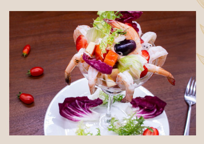
Prawn Cocktail 虾仁沙拉

Mixed lettuce with cucumber, black olive, cherry tomatoes, chicken ham, cheese, boiled egg and lime vinaigrette dressing All price are subject to 10% servi