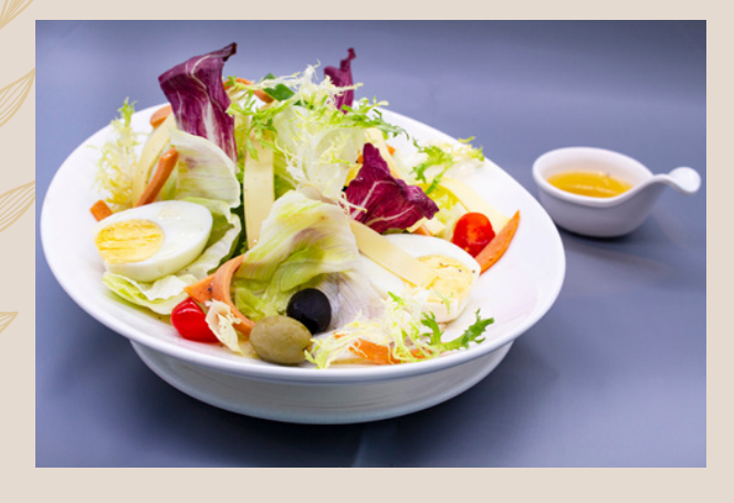
Chef Salad 主厨自制沙拉

French beans, potatoes, olives, tomatoes, boiled egg and tuna with lemon dressing