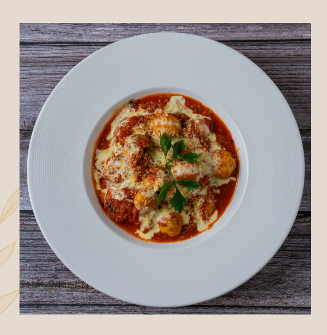
Homemade Chicken Meat Ball 15,000 MMK+ 自制鸡肉球

Marinated canjun spice chicken leg served with mashed potatoes, butter, vegetables, tomato salsa and white wine sauce