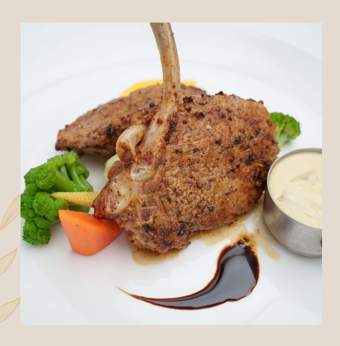
Grilled Pork Chop 猪排配蘑菇酱

Grilled pork chop served with sauteed vegetables, mashed potatoes and mushroom cream sauce