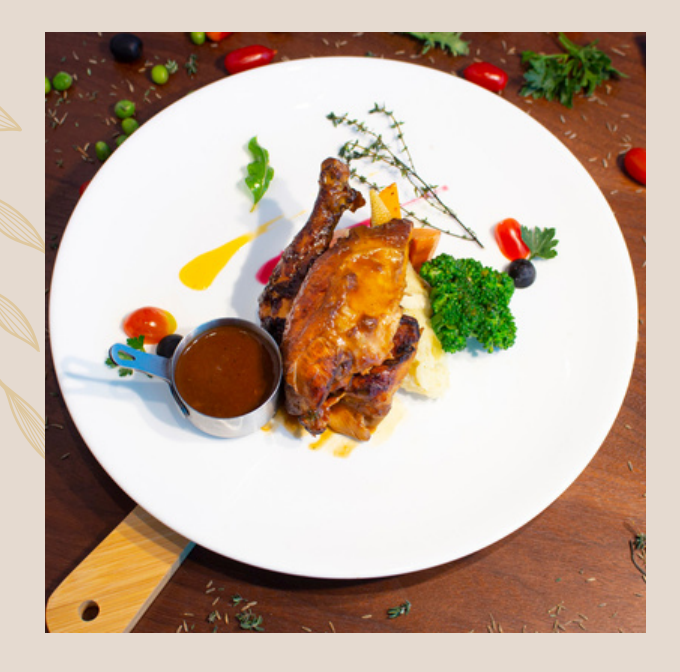
Roasted Chicken 烤鸡肉 (红酒酱/蘑菇酱)

Served on mashed potatoes, accompanied with carrot, baby corn and choice of red wine sauce or pepper sauce