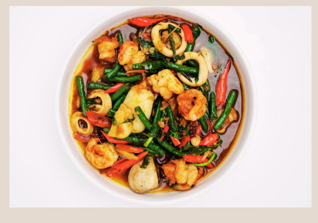
Hot Basil Seafood 泰式罗勒海鲜

Beef tongue with carrot, cucumber, oyster sauce and soy sauce