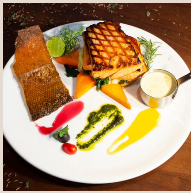
Pan-Fried Salmon Steak 三文鱼排

Oven-baked prawns with mozzarella cheese