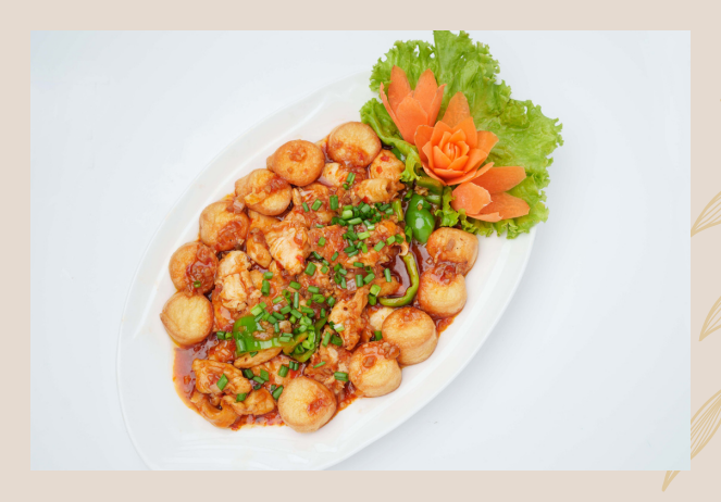
Japanese Tofu with Chicken 22,000 MMK+ 日式豆腐鸡肉

Stir-fried chicken and tofu in hot bean sauce