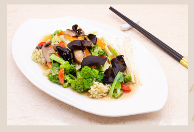
Stir Fired Vegetables 10,000 MMK+炒蔬菜 Stir-fried seasonal vegetables with oyster and soy sauce