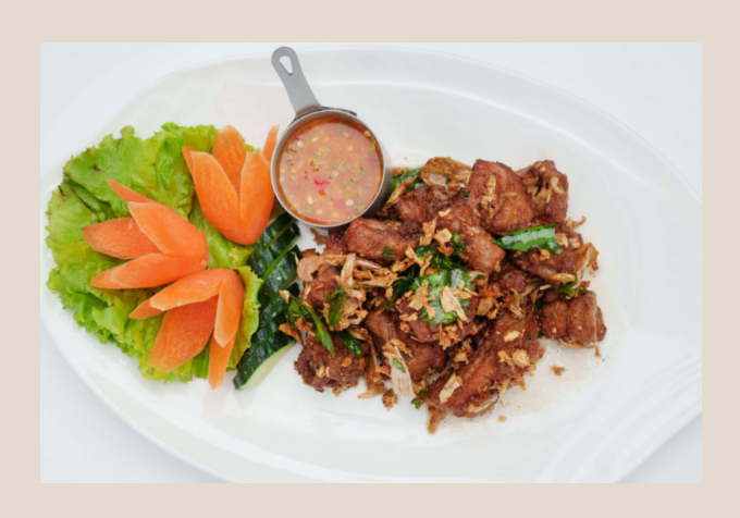
Deep Fried Pork Spare Rib 23,000 MMK+ 炸排骨

Deep fried pork rib with ginger, chili and garlic