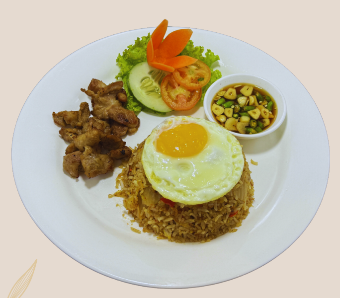
Kimchi Fried Rice (Seafood) 18,000 MMK+ Kimchi Fried Rice (Pork/ Beef/ Chicken) 韩式泡菜炒饭 15,000 MMK+ (海鲜/猪肉/牛肉/鸡肉)

Malay style fried rice with lemon leave, chili, curry leave, fried egg and choice of pork, beef or chicken