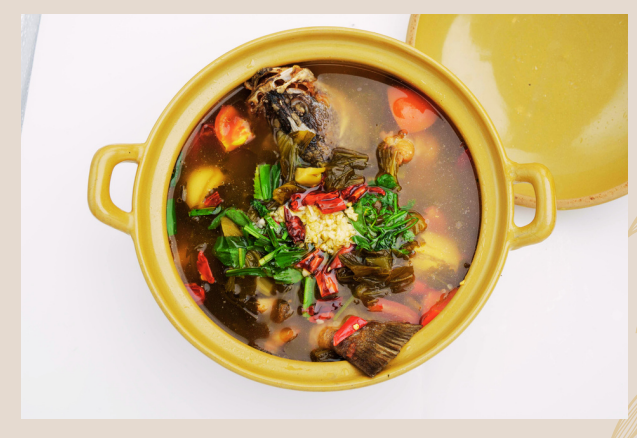
Sichuan Style Sour Mustard Soup 川味酸菜鱼 32,000 MMK+

Chinese styles chicken soup with herbs and dried prunes