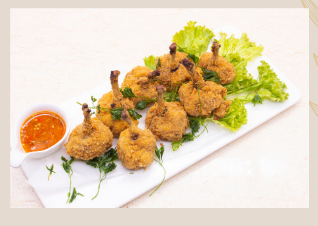
Spanish-Sytle Fried Chicken Wings 西班牙炸鸡翅 19,000 MMK+

Delicious crispy snack made with potato, mozzarella cheese, herbs, spices, egg, flour and bread crumb