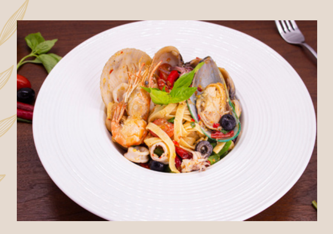
Aglio e Olio Seafood 蒜蓉海鲜意大利面

Spaghetti pasta with basil in tomatoes sauce