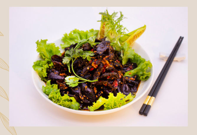
Sichuan Style Black Fungus Salad 涼拌木耳 12,000 MMK+ Black fungus, light soya sauce, black vinegar, garlic and chili