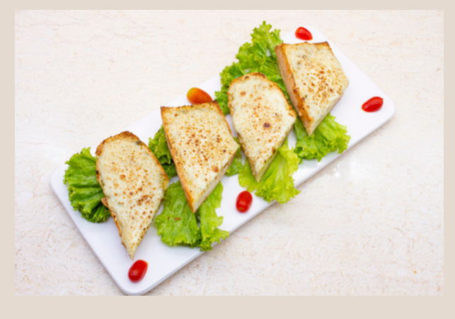
Baked Garlic Bread with Cheese 18,000 MMK+ 蒜蓉面包

Tomato salsa and mozzarella cheese on bruschetta bread