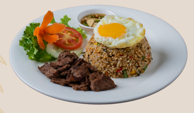
Kampund Fried Rice (Pork/ Beef/ Chicken) Kampund Seafood Fried Rice

甘榜炒饭 (马来风味) 15,000/ 18,000 MMK+ (猪肉/牛肉/鸡肉/海鲜)