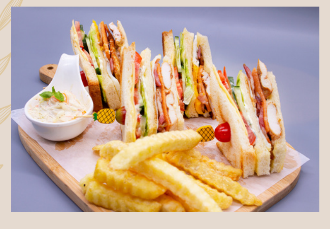
Club Sandwich 三明治

Homemade beef patty topped with pineapple ring, sliced cheese in a sesame bun served with lettuce, tomatoes and french fires