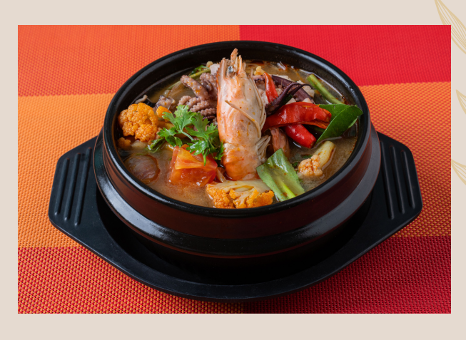
Seafood Tomyum Soup (Small/Big) 泰式冬阳海鲜汤(小/大)

Thai style chicken soup with lemon grass, lime leaves, mushroom, shan coriander and galangal