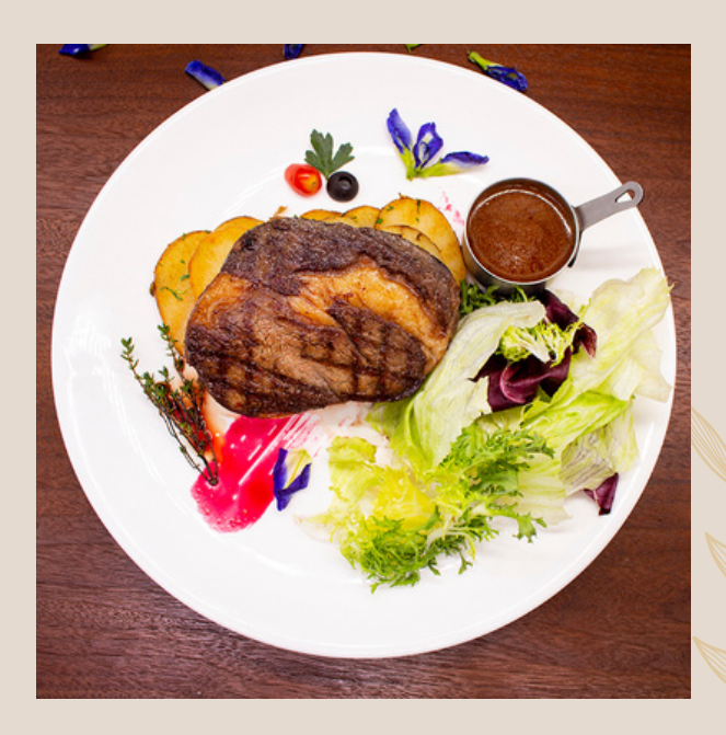
Char-Grilled Rib Eyes Steak 89,000 MMK+ 碳烤牛肋排

Served on mashed potatoes, accompanied with garden salad and red wine sauce