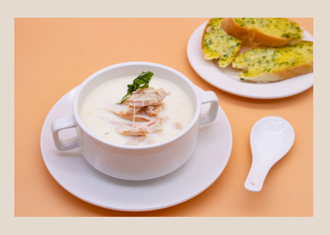
Cream of Chicken Soup 奶油鸡汤

Caramelized onions and beef broth served with garlic bread