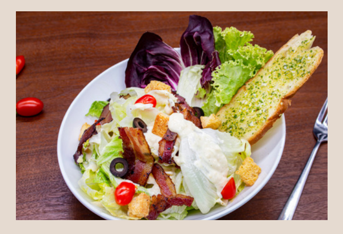
Caesar Salad (Chicken/Bacon) 18,000 MMK+ 凯撒沙拉 (鸡肉/培根) 22,000 MMK+

Cream combines with parmesan cheese and corn served with garlic bread