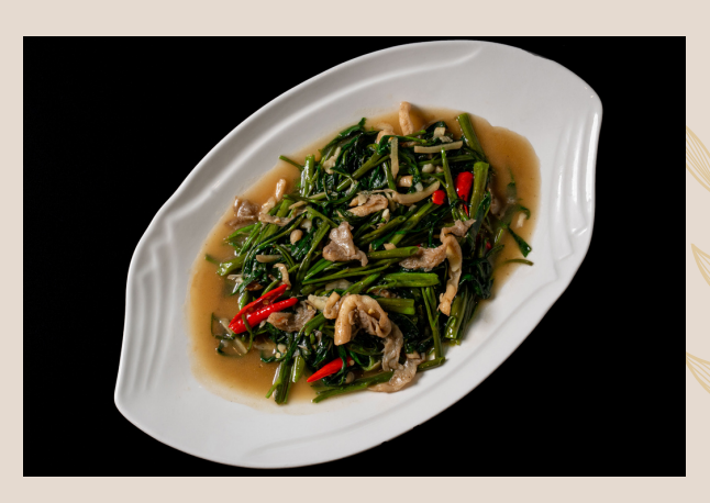
Stir-Fried Watercress 炒空心菜 10,000 MMK+ Stir-fried watercress with snow mushroom