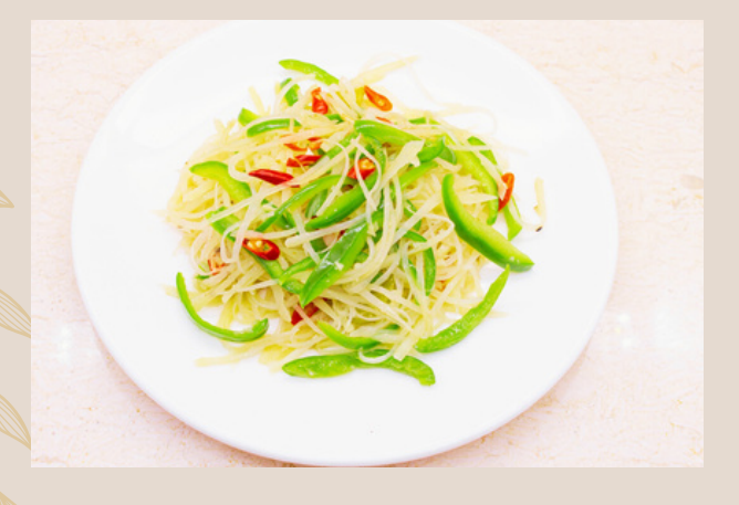
Stir-Fried Capsicum & Potato Strip 青椒土豆丝 10,000 MMK+ Stir-fried capsicum and potatoes