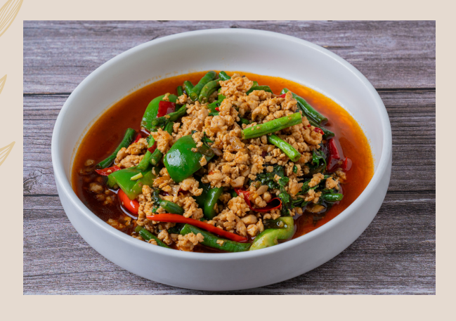
Hot Basil Chicken 泰式罗勒鸡肉

Thai style seafood with hot basil leaves