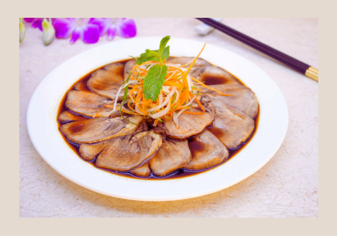
Steamed Beef Tongue 清蒸牛舌