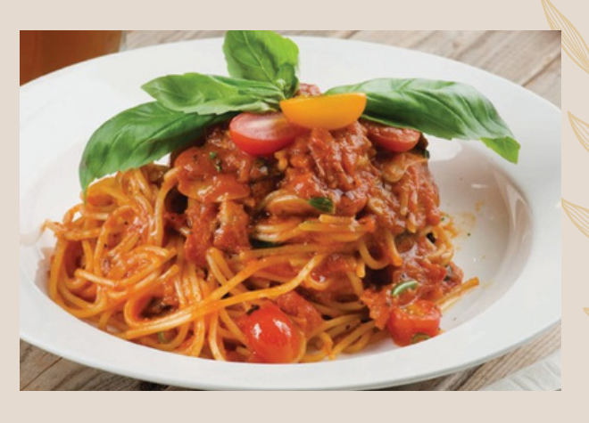
Spaghetti Bolognaise 番茄酱牛肉意大利面

Spaghetti pasta with seafood, garlic, chili, capsicum, cherry tomatoes, black olive, mushroom and dried chili