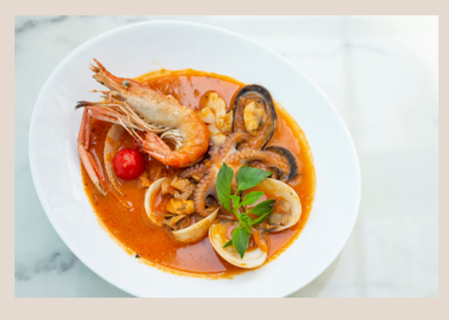
Mexican Style Seafood Soup 21,000 MMK+ 墨西哥风味海鲜汤

Creamy chicken soup served with garlic bread