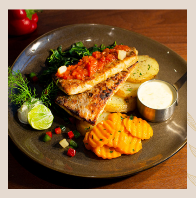
Grilled Seabass 香煎鲈鱼

Grilled pork chop served with sauteed vegetables, mashed potatoes and mushroom cream sauce