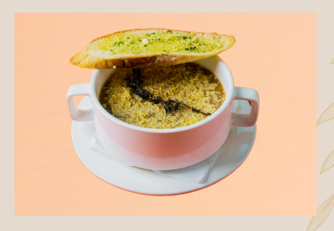
French Onion Soup 10,000 MMK+ 法式洋葱汤

Creamy mushroom soup served with garlic bread