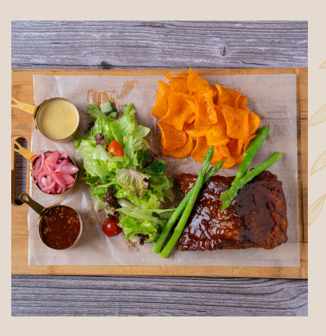
B.B.Q Pork Rib Platter 排骨拼盘

Marinated Pork Rib, served with sweet potato chips and B.B.Q sauce