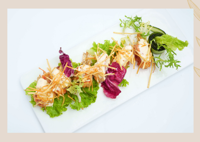
Prawn Mayonnaise 蛋黄酱虾球

Deep-fried marinated chicken wings with cocacola