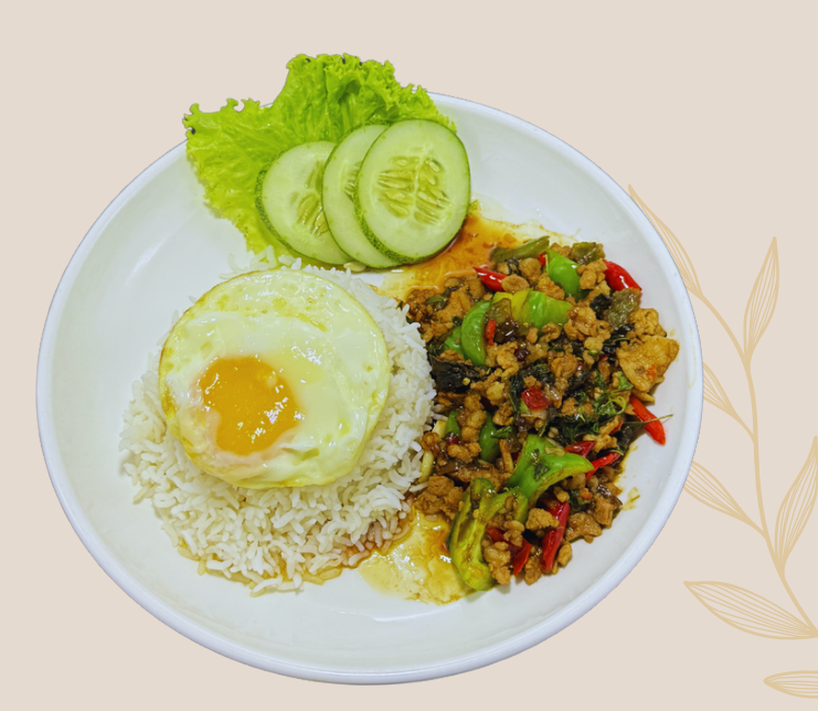
Hot Basil Chicken with Steam Rice 18,000 MMK+ 泰式罗勒炒鸡肉饭

Fried rice with pickled mustard, carrot, green pea, chili, fried egg and choice of pork, beef or chicken