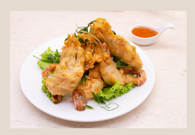
Prawn Tempura 天妇罗大虾