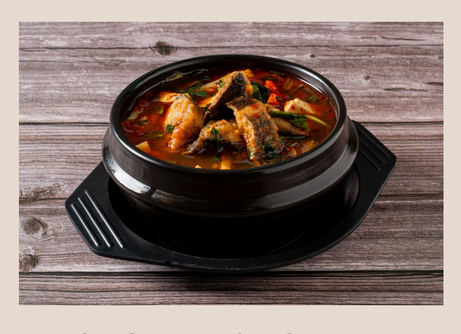
Cat Fish with Sour Bamboo Shoot Soup 酸笋鱼汤 20,000 MMK+

Oxtail, chili, garlic, ginger, carrot and sichuan pepper