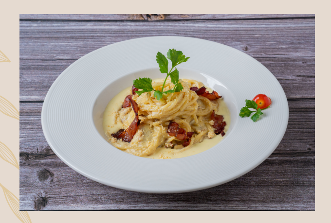
Spaghetti Carbonara 奶油培根意大利面

奶油培恨息不利面 Spaghetti pasta with bacon and mushroom in cream sauce