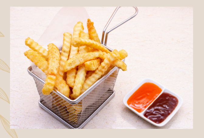
French Fries Potatoes 炸薯条

Deep-fried potatoes served with ketchup and chili sauce