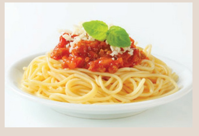
Spaghetti Napolitana 番茄酱意大利面

Spaghetti pasta with minced chicken and basil in tomatoes sauce