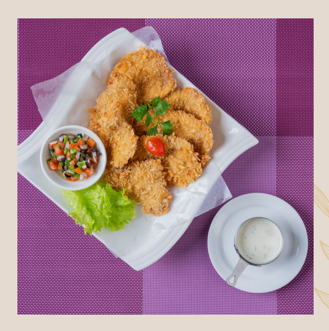
Chicken Corn Nugget 鸡肉玉米块

Home made chicken meatball with mashed potatoes, tomato sauce and parmesan cheese