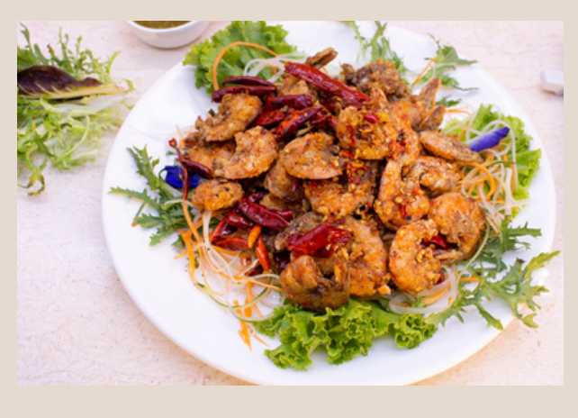
Hong Kong Style Fried Prawns 24,000 MMK+ 港式炸虾

Crispy batter fried prawns served with sweet chili sauce