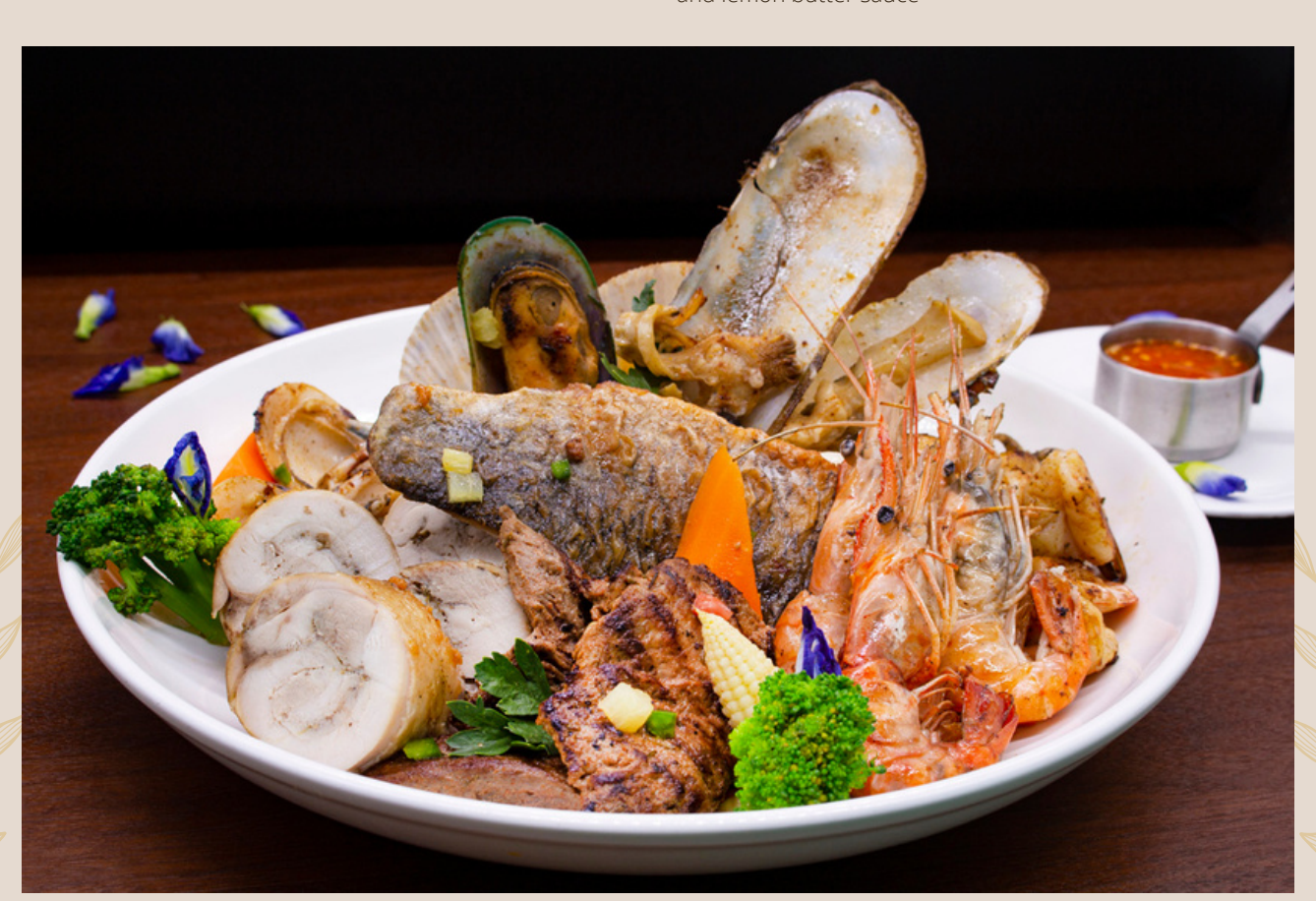
Mixed Grilled 拼盘 (海鲜、牛肉、鸡肉)

Served with mashed potatoes, spinach, pumpkin puree and lemon butter sauce