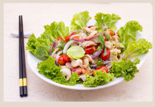
Thai Seafood Salad 泰式凉拌海鲜

Grilled beef with cucumber, tomatoes, onion, mint and Thai Sauce