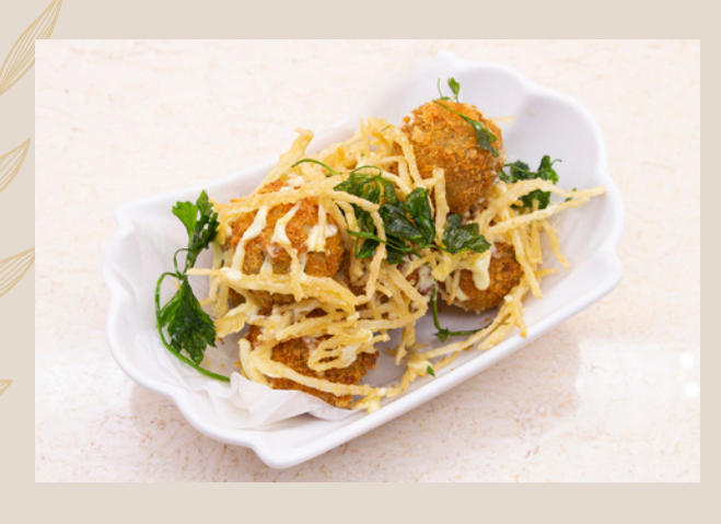
Potato Cheese Balls 土豆芝士球

French bread with garlic and mozzarella cheese