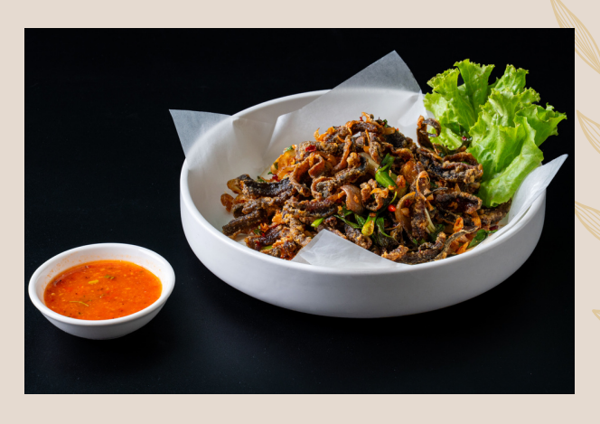
Deep-Fried Spicy EEL 香辣炸黄鳝

Deep fried double braised corn beef with flavour of garlic and red chili