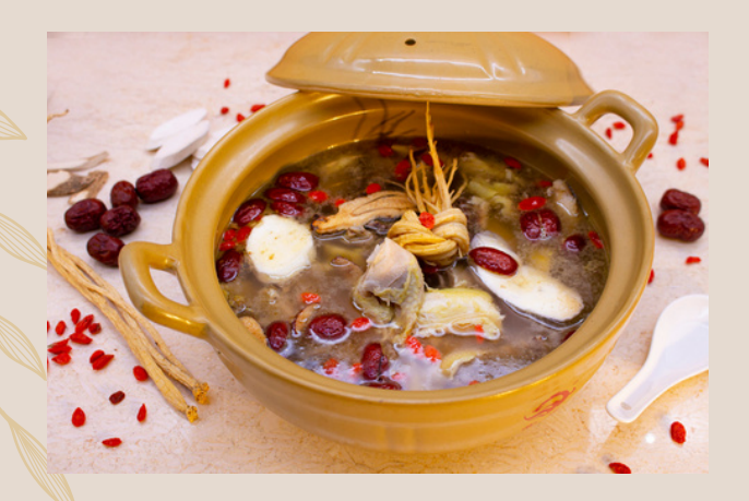
Chinese Herbal Chicken Soup (Small/ Big) 19,500/ 32,000 MMK+ 药材鸡汤(小大)

Chinese styles chicken soup with herbs and dried prunes