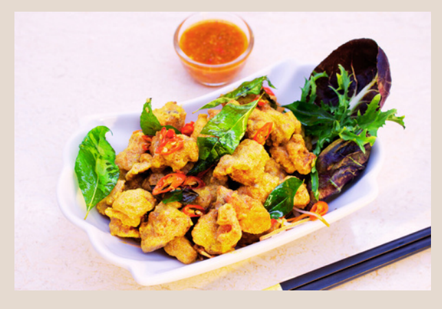
Salted Egg Chicken 咸蛋黄炸鸡

Deep fried pork rib with ginger, chili and garlic