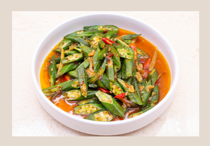
Malaysian Stir-Fried Lady Fingers 马来风味炒秋葵 10,000 MMK+ Stir-fried lady fingers with sambal chili