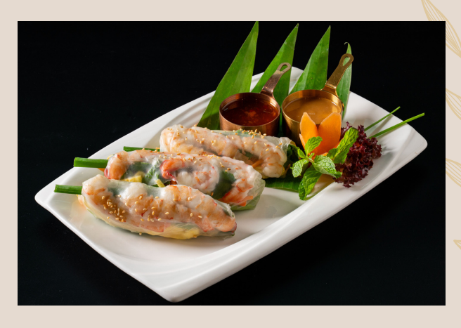
Vietnamese Spring Roll 越南春卷

Shredded chicken served with B.B.Q sauce and lime dressing.