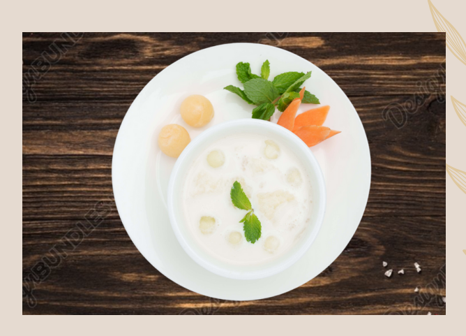
Sago with Coconut Milk & Honey Melon 椰奶哈密瓜西米露 6,000 MMK+

Banana, rum, sugar, orange juice, caramel topping.