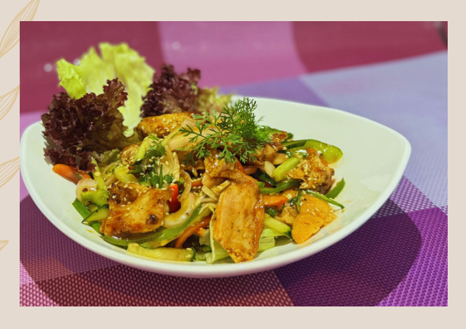
B.B.Q Chicken Salad 凉拌鸡肉萨拉

Seafood with cucumber, tomatoes, onion, mint and Thai