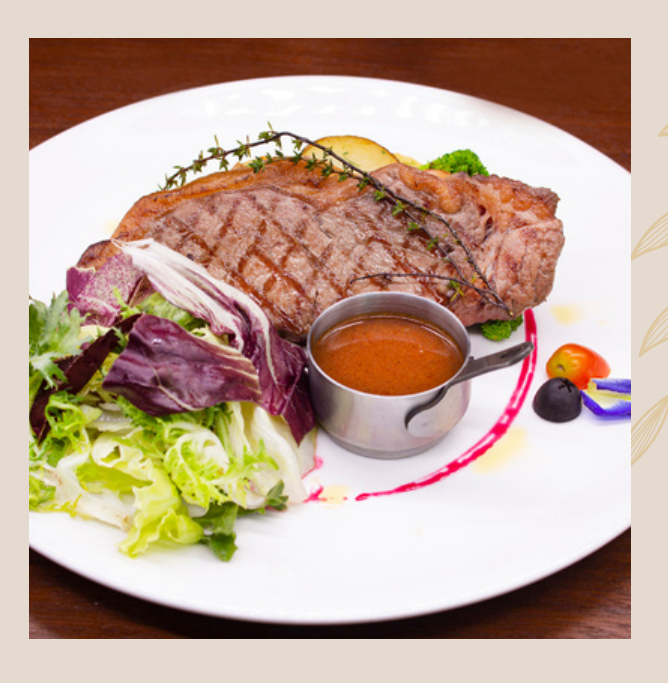
Grilled Wagyu Steak 和牛排