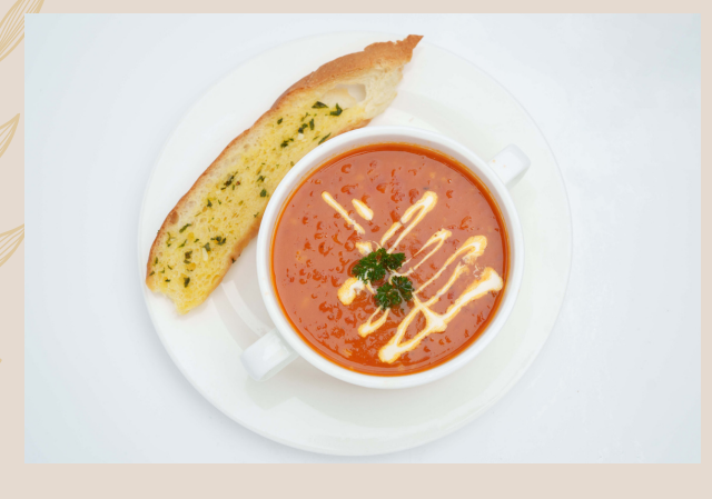
Cream of Fresh Tomato Soup 10,000 MMK+ 番茄奶油浓汤

Fresh seafoods with mexican spice in tomato flavored broth and garlic bread