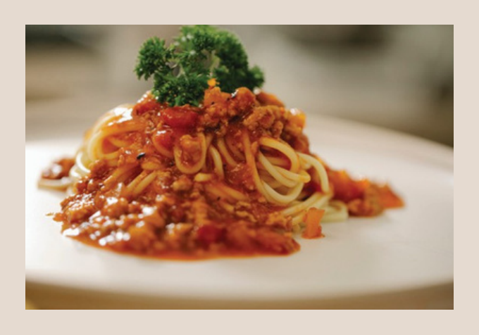
Spaghetti Polonaise 番茄酱鸡肉意大利面

Oven Baked rice with creamy tomato sauce, mozzarella cheese and choice of seafood, spicy fish fillet, chicken, BBQ Pork or beef