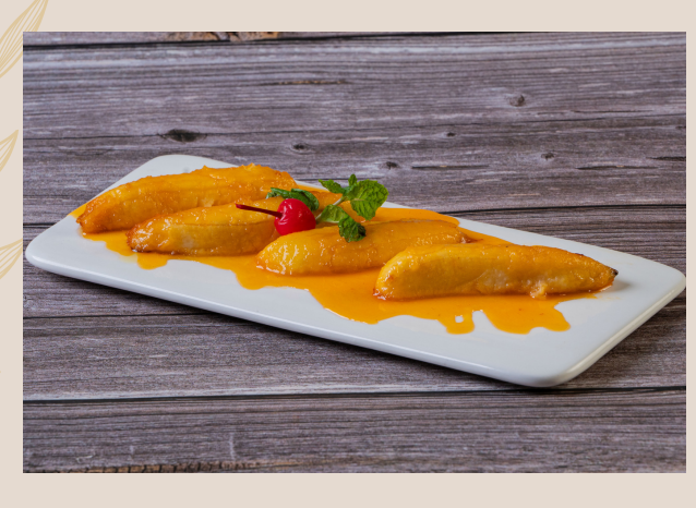
Banana Flambe Home Style 10,000 MMK+ 火焰焦糖香蕉

Banana, rum, sugar, orange juice, caramel topping.