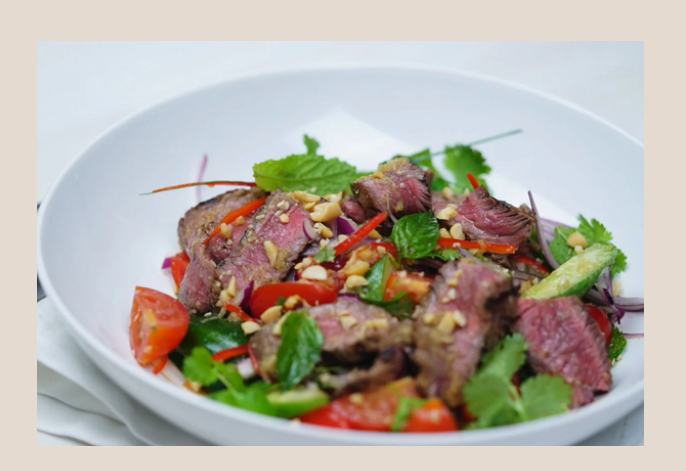
Thai Beef Salad 泰式凉拌牛肉