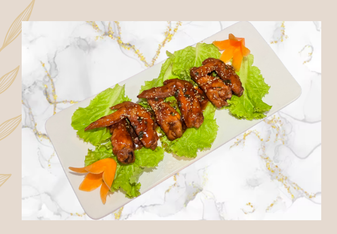
Coca Cola Chicken Wings 可乐鸡翅

Deep fried prawns, ginger, dried chili and vinegar